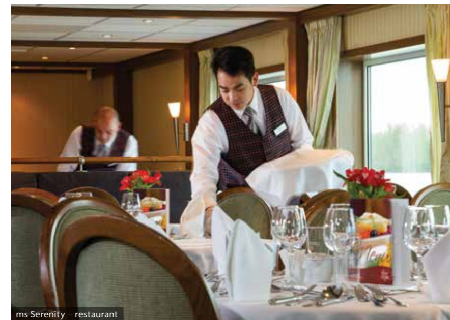
ms Serenity – restaurant