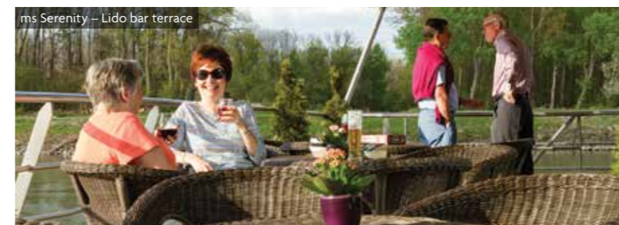
ms Serenity – Lido bar terrace